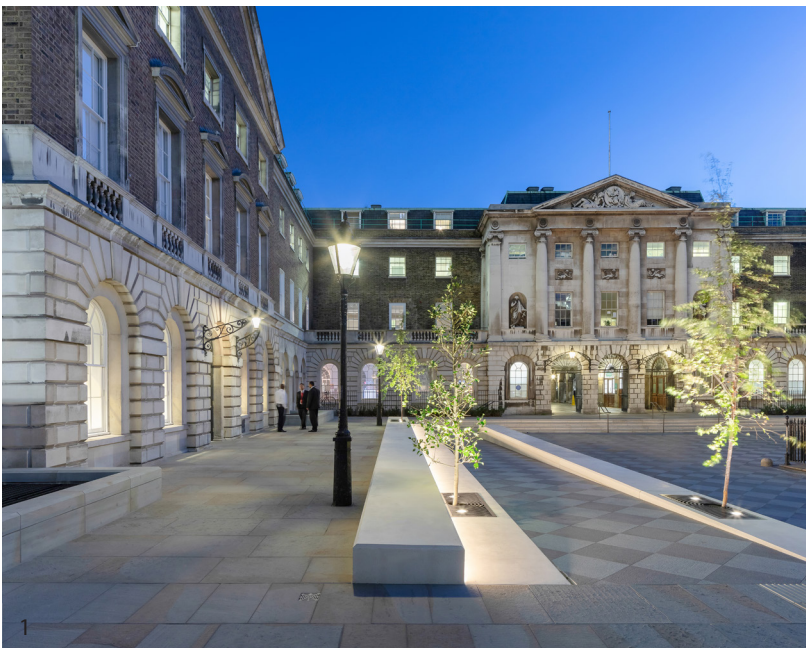
Above - Guys Courtyard by Night

Architect: LTS Architects Structural Engineer: WSP M&E Engineer: WSP QS: Turner & Townsend PM: Lendlease (design & tender), GSCI (construction) Contractor: Interserve Paragon Landscape: LDA Design Lighting: ARUP Lighting Theatre design: ARUP Heritage: Alan Baxter Associates Planning: Deloitte Planning Services Acoustics: Hann Tucker Building Control: MLM CDM: Turner & Townsend Fire: ARUP